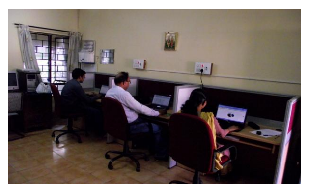
Students carrying out their work at workstation

The Station has good Hostel and guest house facilities for the students and visitors. The staff dispensary meets the medical needs of the staff and students. The Placement Committee of the Station ensures the employment of the students in dairy and food industry, regulatory bodies and academic institutions. The students of the Station are well placed professionally both in India and abroad