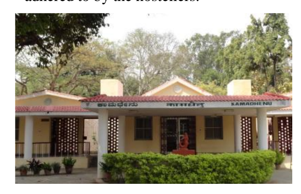
Kamadhenu guest house at SRS of NDRI, Bangalore

14.1 Adequate Hostel accommodation is available with all modern facilities in terms of well furnished rooms, sports, indoor games, TV Rooms, Reading Rooms, Cultural Activities etc. Mess facility with modern infrastructure is available at the Station. A canteen is also available for refreshments. There is a separate Hostel accommodation for girl students. In order to regulate community living harmoniously in the Hostels, certain rules have been framed for compliance by the students. These rules are meant for the students to maintain a high order of discipline, honesty and moral conduct for self and fellow hostellers. Students admitted this in Institute are meritorious. They are supposed to lead a career oriented living in the Hostels. While in the Hostel they are responsible for up keep and look after of rooms, furnishing and fixtures. They are also supposed to conduct extremely well within and outside the Hostels. Payment of fees and dues, proper use of Hostel common facilities. room. mess. harmonious living and regulations regarding Hostel visiting hours are some of the important points that have to be adhered to by the hostellers.