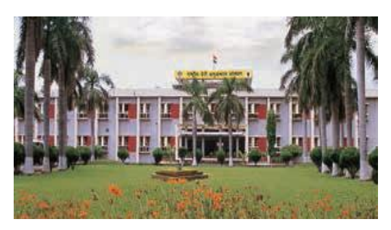
Administrative Block of NDRI Headquarters, Karnal

National Dairy Research Institute (NDRI), Deemed University (here-in-after referred to as the Institute) serves as the prime centre for Research, Extension and Human Resource Development Programmes of the country in the field of Dairying. The Institute was developed from the erstwhile Imperial Institute of Animal Husbandry and Dairying established at Bangalore in 1923. The Main Campus of NDRI is now located at Karnal in Haryana State. It has two Regional Stations: Southern Regional Station at Bangalore and Eastern Regional Station at Kalyani (West Bengal).