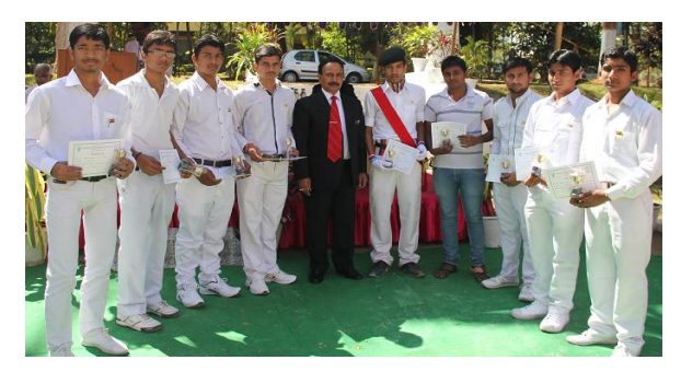
Diploma Students with the Director, NDRI during Republic Day Celebration at SRS of NDRI

Students are expected to attend all the theory and practical classes. The regulations require that the students must maintain prescribed minimum attendance of 75% in the classes.