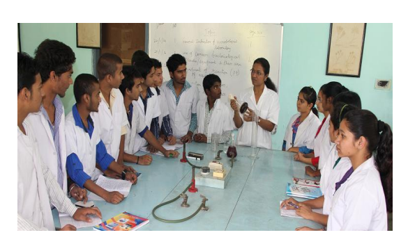
Diploma students in the Microbiology Laboratory at SRS of NDRI, Bangalore

3.1.1 Diploma in Dairy Technology is being offered from the year 2013 at Southern Regional Station of the Institute, Bangalore. This Diploma programme offers intensive training in dairy processing, quality assurance of milk and milk products, engineering aspects of dairy processing equipments and dairy business management.