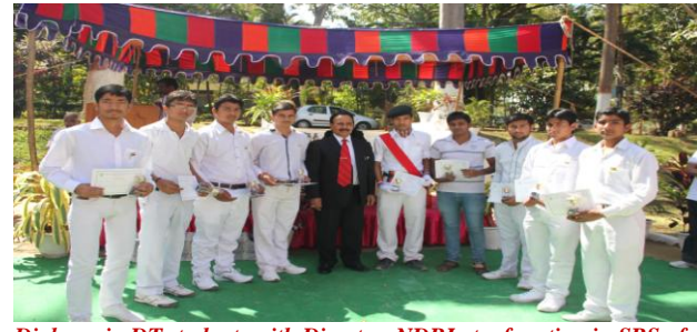
Diploma in DT students with Director, NDRI at a function in SRS of NDRI, Bangalore

2.4 Dairy Production Facilities: The Regional Station has the necessary infrastructure needed for milk production. The fodder farm of 24 hectares raises high yielding fodder crops