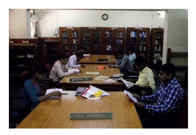
Students in the Library of SRS of NDRI, Bangalore

Computer facilities (about 60 computer systems) to facilitate data analysis, documentation, e-mail communication and programming packages for staff and students.