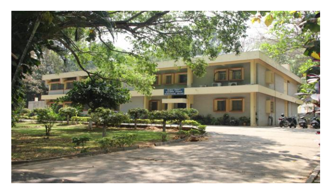
Library at SRS of NDRI, Bangalore

2.9 Other Facilities: The Station has well established computer facilities with internet and Wi-Fi access. There are LAN enabled