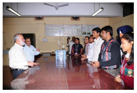
Director General of ICAR interacting with the Students at SRS of NDRI, Bangalore

Dates" of the Information Bulletin. The merit list, showing names of qualified candidates, made on the basis of marks obtained in the Entrance Examination will be displayed on the NDRI website only and no intimation will be given to candidates by letter or fax or any other means. The candidates are required to visit NDRI website (www.ndri.res.in).