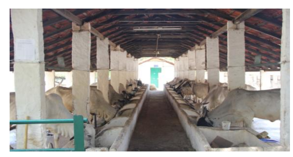
Cattle farm at SRS of NDRI, Bangalore

round the year for a herd of about 250 cattle. The cattle farm houses about 250 cattle (200 Deoni and 50 crossbred). The milking average is 4.5 kg/day for Deoni and 12 kg/day for crossbred cows. Best yield of Deoni cow is 11.5 kg/day and 36 kg/day for crossbred cows.