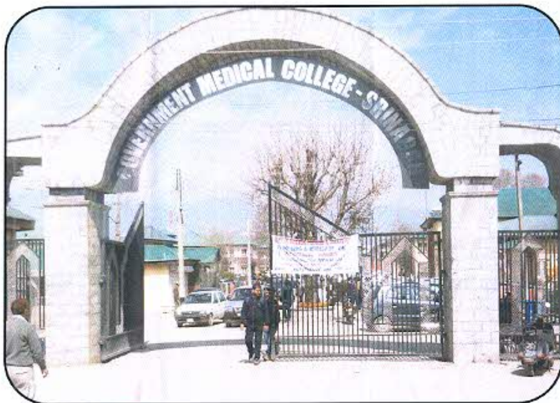
GOVT. MEDICAL COLLEGE, SRINAGAR

The number of seats in different courses/ colleges may increase or decrease. The exact number of seats available will be notified at the time of counselling for admission. The details of the available seats, as on date, discipline-wise, in different Colleges/ Institutions of the State for the academic year-2014 are given below.