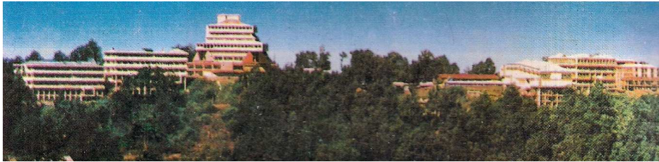
A VIEW OF H.P. UNIVERSITY, SHIMLA